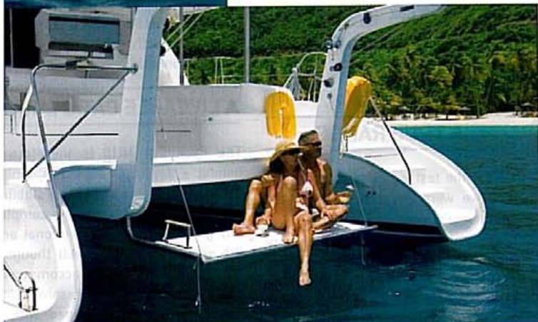
The aft platform has a tip-up seat which is both practical and pleasant...