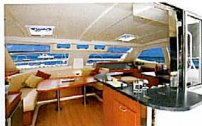
Nice finishing, pleasant and practical accommodation: we are aboard a Léopard.