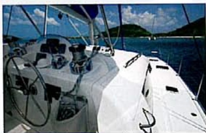
The new raised steering position offers an excellent all-round view.