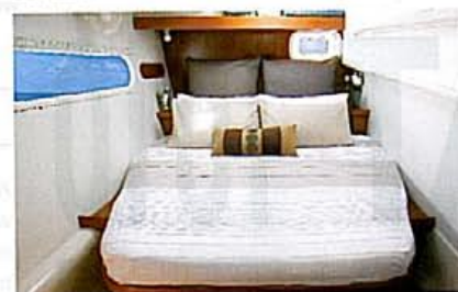
The cabins are large and well-ventilated.